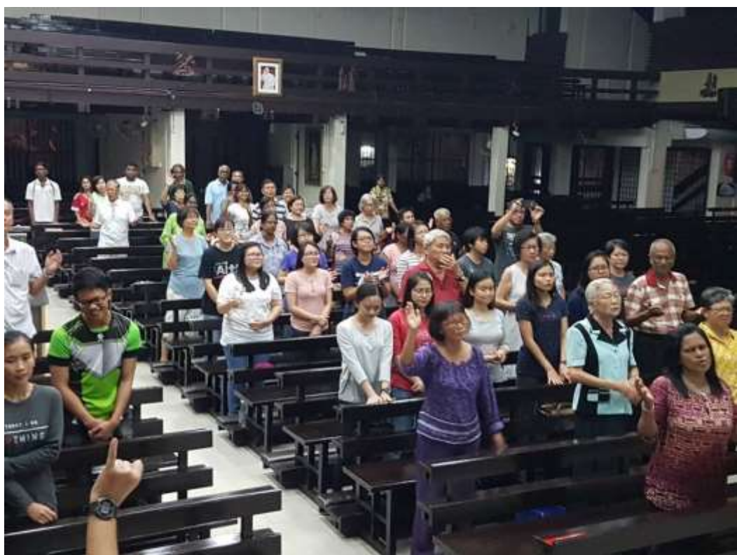
2. Faithful at Praise & Worship (2/2)