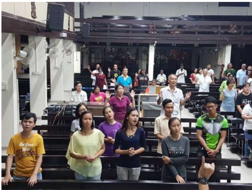
1. Faithful at Praise & Worship (1/2)