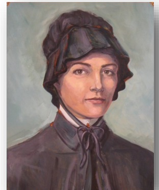
Feast Day: January 4