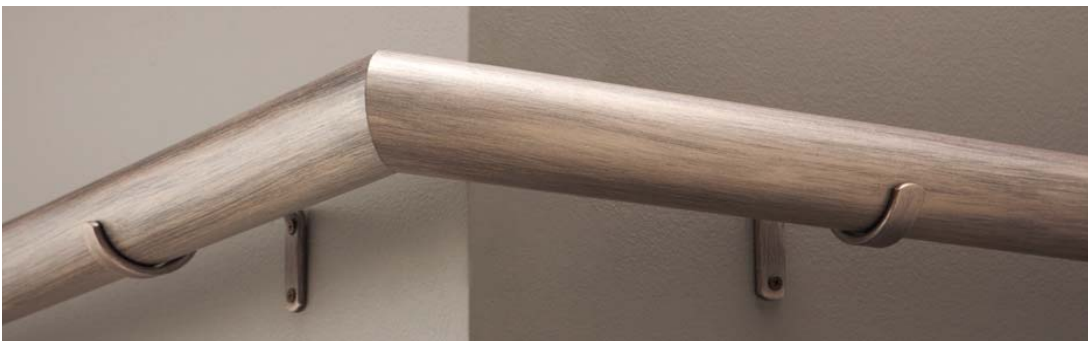
Shown: 90° outside corner miter for 225WS wood pole, WL1 steel brackets, finish 710 Tarnished Silver