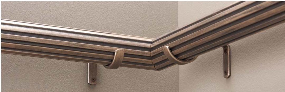
Shown: 90° inside corner miter for 225WG wood pole, WL1 steel brackets, finish 710 Tarnished Silver