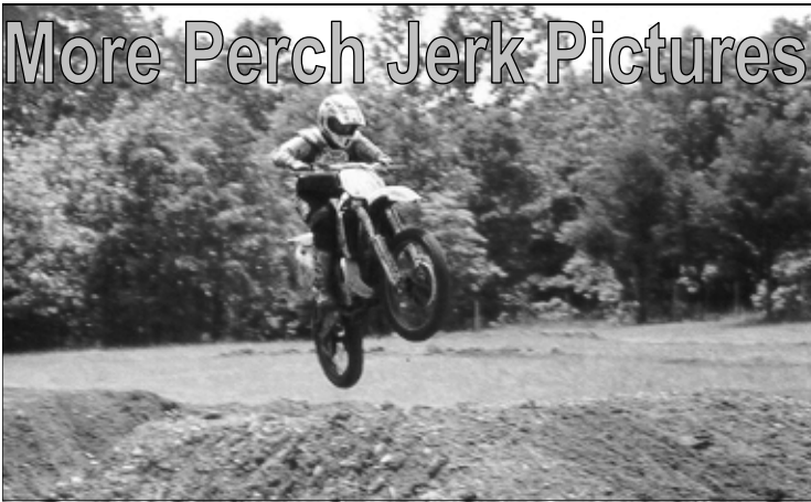
One of the riders airs it out over one of the jumps on Greg's motocross track. This is one of the neatest personal motocross tracks I have ever ridden.