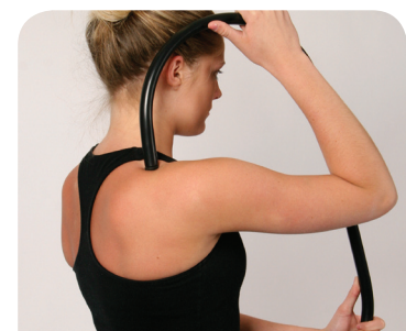
Self-Care Tools and instruction available for home or work