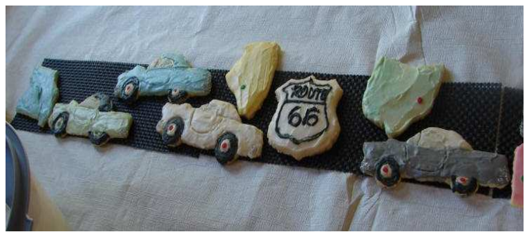
Missouri Cookies showing the trip STORAGE KEYSTONE GARAGE CAR COOKIES SHOWING THE TRIP