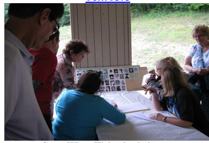
Guess Who - High school pictures