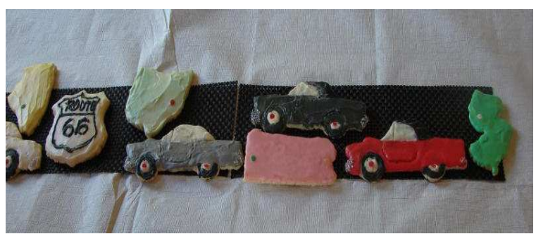
to Springfield by Bill Downing New Jersey