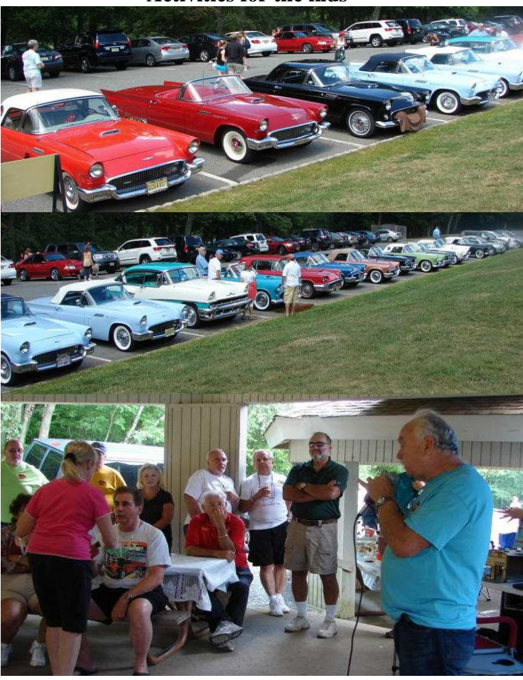
Activities for the kids