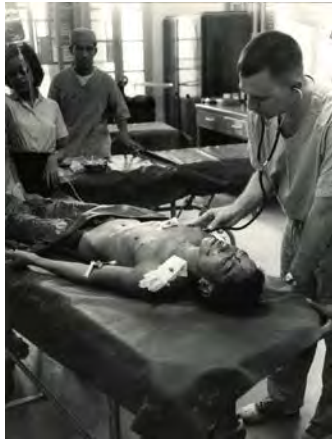
Da Nang Civil Hospital