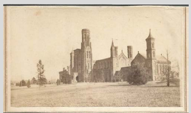
Original Smithsonian Institution Sitting Alone On The Future Mall

The challenge of housing artifacts brought back from the Exploratory Expedition provokes an end to the back and forth political haggling about how best to utilize a monetary windfall arriving in America in 1835.