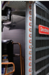
Goodman's SMARTCOIL 5mm tube condensing coil design optimizes the heat transfer ability of R-410A refrigerant compared to standard 3/8" copper tubing.

You can count on your Goodman brand GSX13 Air Conditioner to keep you cool on even the hottest summer days. Your Goodman brand air conditioner starts with an energy-efficient compressor, which operates in tandem with our high-efficiency coil. The coil is made of rifled refrigeration-grade copper tubing and corrugated aluminum fins in a design that maximizes surface area. These high-quality components together cool your home effectively.