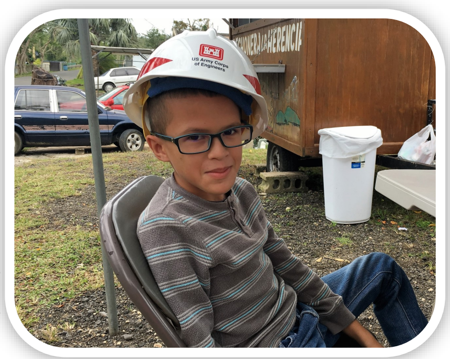
Photo: A young Puerto Rican wearing the Corps hat hard. His family cooked a Puerto Rican meal for the linemen.

My assignment has been a humbling experience. The Corps is managing a $1.9 billion contract to restore the island's power grid system. It was determined that 80% of the 32,400 miles of transmission and distribution lines were damaged. I have worked with contractors that were involved in rerouting a primary electric line through the mountain country that served a community water pump. This line also provided electricity to over 740 homes that have been without power for 5 months.