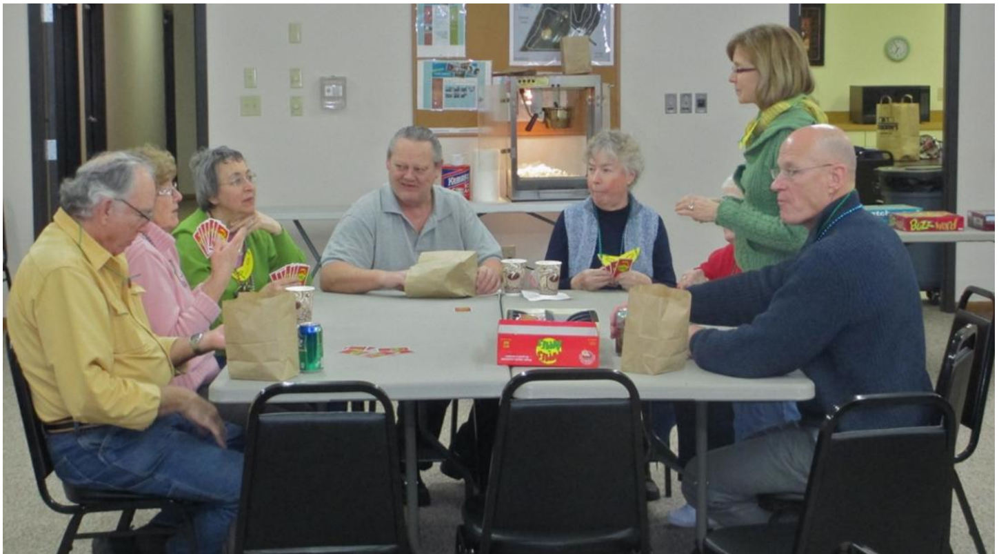
Game Night fun at the Palmer Township Hall Feb. 12 th .