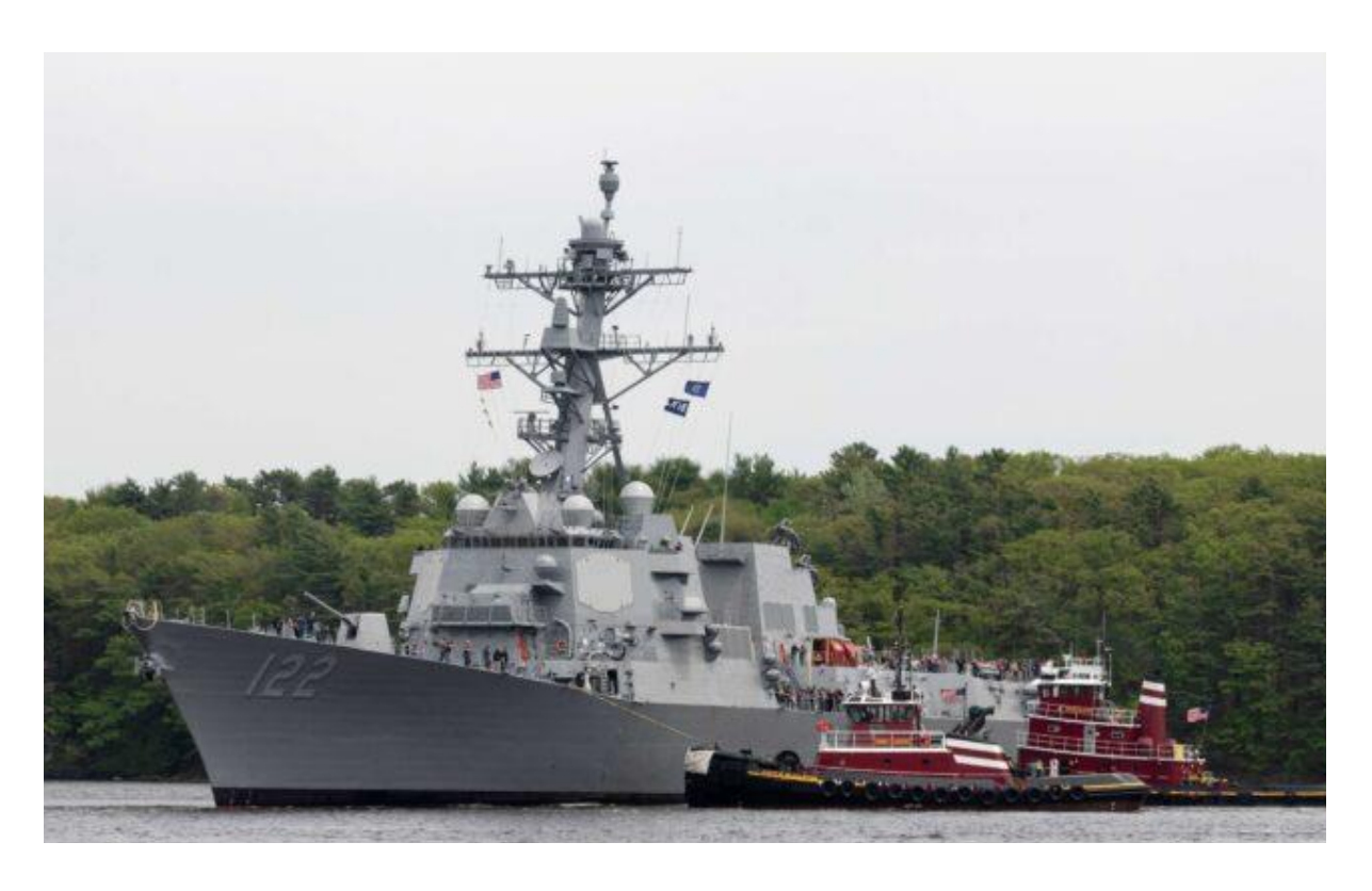
Destroyer John Basilone (DDG-122) returns from Navy acceptance trials on May 23, 2024.

Guided-missile destroyer John Basilone (DDG-122) completed its Navy acceptance trials ahead of delivery to the service, shipbuilder General Dynamics Bath Iron Works.