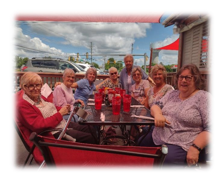
New Ladie's group, The Rosetta's, enjoying our first outing.