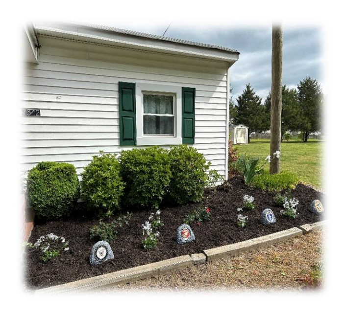
Military stones placed in Honor & Memory of GVL's Veterans.