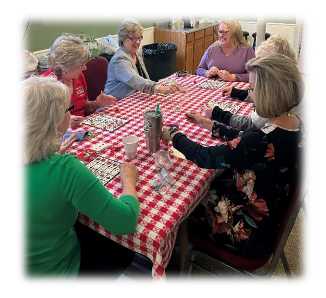
Playing cards after monthly meeting.