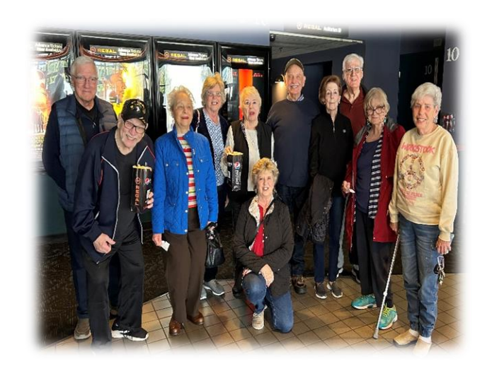
Outing to "Cabrini" movie on opening day.