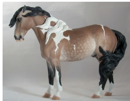
CHAMPION PONY/MINI HORSE: CHESTER (KB)

Other Pure or Mixed Pony Breed (8): 1-Chester (KB), 2-Cinnamon (SS), 3-LBR Treisty (JG), 4-RF Kirsten (TM), 5-Ragnar Lothbrok (KW), 6-DA The Blue Angel (JV), 7-Mellyna (JG), 8-Calico Splash (JV)