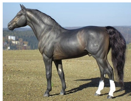
RES. CHAMPION SIMPLE REMAKE/REPAINT/HAIR OR SCULPTED MANE/TAIL: AMANTUS VS (SN)

Major Remake & Repaint with Hair Mane/Tail: Traditional or Larger (73): 1-Ima Rock-A-Teer (CM), 2-Willie's Wyld Fire (RN), 3-Hathor (SN), 4-W.E. Tonka (HC), 5-Plastique (SS), 6-Gazelle (KB), 7-RAS Elian Demoiselle (CM), 8-DO Bessancour Moulin Rouge (JV), 9-DO Dun IV (JV), 10-D.O. Sportin' Chance (BH), HM-Special Print (RN)