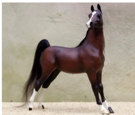
RESERVE CHAMPION EXTREME RE-MAKE/REPAINT/HAIR OR SCULPTED MANE/TAIL: ILLUSION (KM)

Flocked with Flocked Mane/Tail and Remade & Flocked with Flocked Mane/Tail: none