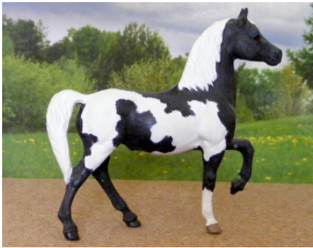
RES. CHAMPION SPANISH BREED: BACHIEDA (TM)

American Saddlebred (1): 1-Cindy Lou Who (AP)