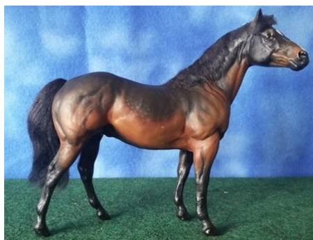
RES. CHAMPION SIMPLE REMAKE/ REPAINT/HAIR OR SCULPTED MANE/ TAIL: BR DANTON (HC)

Major Remake & Repaint with Hair Mane/Tail: Trad. or Larger (7): 1-Alconbury Starbringer (SS), 2-Rocking Chair Renegade Revel (CM), 3-Brookridge Diamond (LB), 4-Telemann (LB), 5-Indiana Jones (LB), 6-Moonlight Nugget (HC), 7-Diamond Legacy (SS)