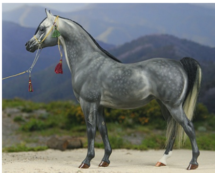
CHAMPION REPAINT/HAIR OR SCULPTED MANE/TAIL: MON NAFA RANI (CR)

Repaint with Non-Hair Mane/Tail: Smaller than Classic Size: no entries