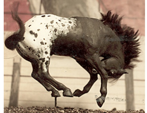
Mares and Geldings (17): 1-Death Star (SS) [pictured at top of next column], 2-*Arwen (MB), 3-Lonesome Dove (CM), 4-Rohirrim Impressive (MB), 5-Mountain Knight (CC), 6-Duke Nukem (SS), 7-Do Wacka Do (SS), 8-Riff Raff (SS), 9-F.O. Bolereau (SS), 10-Sweet William J (CM), HM-Betegeuse (SS)