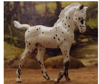
CHAMPION FOAL: RICATEZ (AP)

Sport Foal & Spanish Foal & Gaited Foal & Draft Foal & Pony Foal & Longear/Exotic/ Fantasy Foal: none