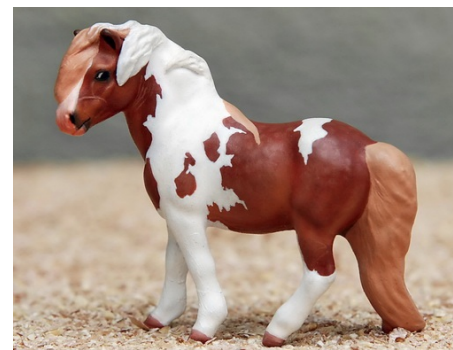
RES. CHAMPION PONY/MINI HORSE: CAPTAIN'S FLASHY JET (KM)

Longear (19): 1-Rebel Yell (RN), 2-Jeb (SS), 3-Demeter (SS), 4-Cutacross Shorty (SS), 5-DA Bardigano Honest John (JV), 6-Sunday Best (CC), 7-All Ears (TM), 8-123 (HC), 9-MN Elwood Blues (RN), 10-Tulpe (HC), HM-Joshua (SS)