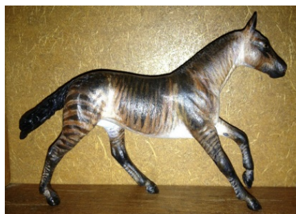
RES. CHAMPION LONGEAR/EXOTIC/FANTASY: IMAGINE THAT (STR)

Stock Breed Foal (23): 1-Dream Again (KM), 2-Scimmy's Gay Blade(SS), 3-Foxy Humdinger (SS), 4-Rowdy Redford (LB), 5-KT Continental Rose (CM), 6-Samiga (LB), 7-Foxy Robin J (JG), 8-Quita Cowboy (SS), 9-Indy Annah (LB), 10-HD Partry Clothes (SS), HM-Twister Hancock(JG)