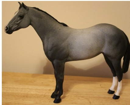
RES. CHAMPION STOCK BREED: POCO GRAYBAR (LB)

Arabian (9): 1-Al Ouisha (SN), 2-Fireo (NF), 3-Moon Shadow II (MW), 4-Andro Umeda (SM), 5-lbn Samekh (AP), 6-Ancalime (KW), 7-Tariifah (BH), 8-Nhi Vanye I Chyya (LB), 9-Telemann (LB)