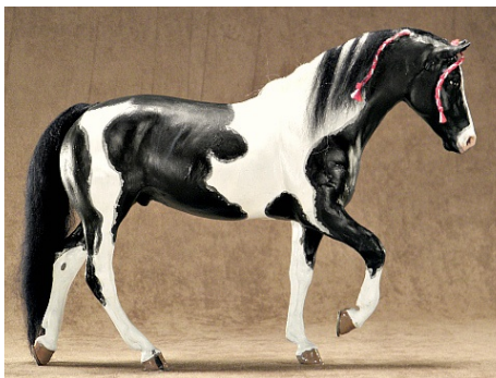
CHAMPION GAITED BREED: FENRIS SIR PRIZE (CM)

Other Pure or Mixed Gaited Breed (10): 1-Blue Moon Fox (HC), 2-Foxy Moonshine (CM), 3-Ima Travelin' Man (CM), 4-Sparkling Chablis Z (CM), 5-LBR Albuquerque (JG), 6-Hit The Switch (SS), 7-TS Galilean Dragoness (MP), 8-Thumbs Up (HC), 9-Shawshank (BA), 10-Midnight's Mac (HC)