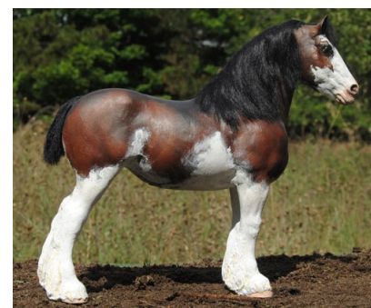
RES. CHAMPION DRAFT BREED: SPARROWWOOD BEAUTY (SS)