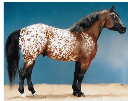
RES. CHAMPION MAJOR REMAKE/ RE-PAINT/HAIR OR SCULPTED M/T: ROCK-ING CHAIR RENEGADE REVEL (CM)

Extreme Remake & Repaint with Hair Mane/Tail: Traditional or Larger (9): 1-Diamond Handsome Devil (BH), 2-Birchwood Geisha Boy (BP), 3-Diamond Flame (SS), 4-Diamond Fancy Cat (CM), 5-Brookridge Diamond (AP), 6-Merry Mountain Mist (AP), 7-RM Bay Bandit (AP), 8-Rockledge Diamond Lark (CM), 9-SD Conversano Diamond (AP)