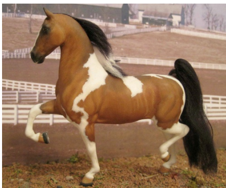
RESERVE CHAMPION GAITED BREED: CAPITAL GENIUS (HC)

Clydesdale/Shire (13): 1-RM Nuclear Winter (KW), 2-Sparrowood Rob Roy (SS), 3-RAS Elian Demoiselle (CM), 4-Rumney-hill Victoria (SN), 5-Amazing Heart (SN), 6-