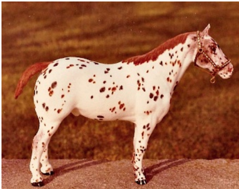
Stock Breeds (1): Kingpin Machado (CM)

Breed Classes: Photo formats other than 35mm or digital