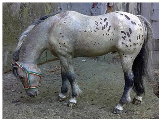
1980s COLOR DIVISION OVERALL RESERVE CHAMPION: LBR TJORBEN (JG)