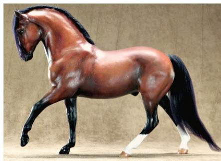
RESERVE CHAMPION SPANISH BREED: CAPRICHOSO (CM)

ASB (9): 1-Sir Arthur (HC), 2-DW Interpretation (HC), 3-Diamond Sungold (AP), 4-Grey Mercedes (SS), 5-Manchester Memory (JW), 6-Highand Heartbreaker (SS), 7-Sundae Best (HC), 8-Business As Usual (HC), 10-LL Bomber (HC)