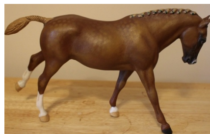
RESERVE CHAMPION PONY/MINI HORSE: HI HO HASTINGS (LB)