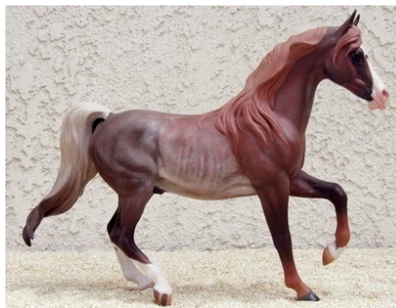
CHAMPION SIMPLE REMAKE/RE-PAINT/ HAIR OR SCULPTED MANE/TAIL: LJJ ROYAL FIRE (KM)

Simple Remake & Repaint w/Non-Hair Mane/Tail: Smaller than Classic (2): 1-Skip Mount (RN), 2-Autumn Storm (HC)