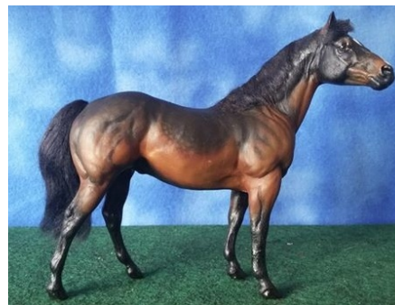
CHAMPION PONY/MINIATURE HORSE: BR DANTON (HC)

Miniature Horse and Other Pure or Mixed Pony Breed: no entries