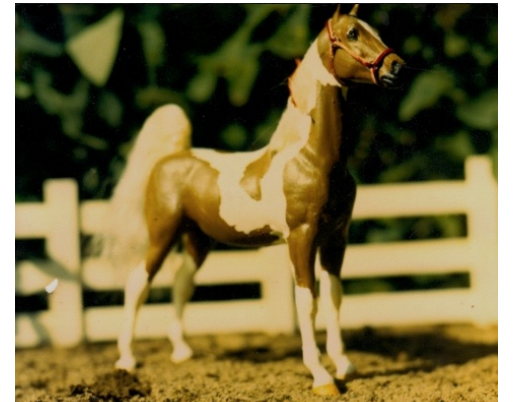
Foals (2): 1-Eye Twinkler (NF), 2-My Name Is Michael (SS)