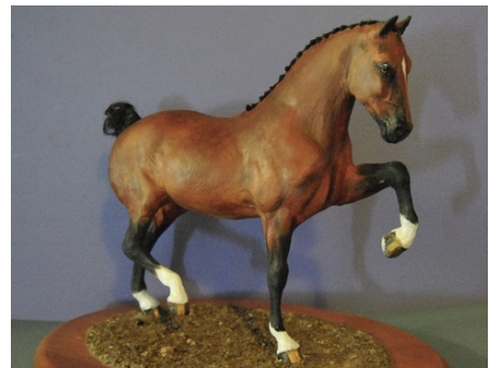
RESERVE CHAMPION SPORT BREED: BIRCHWOOD GEISHA BOY (BP)

Paso Fino/Peru.Paso (1): 1-Bachieda (TM)