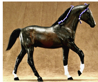
RESERVE CHAMPION FOAL: SO DELITE'S TOP HAT (CM)

1980s BREED DIVISION OVERALL CHAMPION: BANG TANGO (LJ)