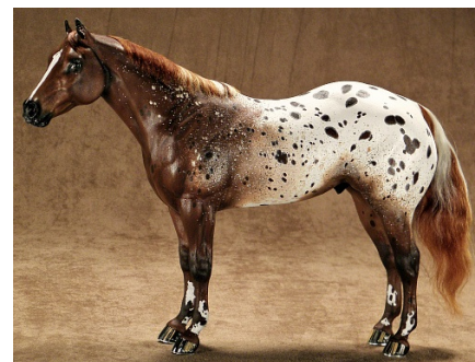
CHAMPION MAJOR REMAKE/RE-PAINT/HAIR OR SCULPTED MANE/TAIL: IMA ROCK-A-TEER (CM)

Major Remake & Repaint with Non-Hair Mane/Tail: Smaller than Classic (2): 1-Wishful Thinking (KM), 2-Allure (KB)