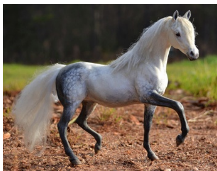
RES. CHAMPION REPAINT/HAIR OR SCULPTD M/T: MOON SHADOW II (MW)

Simple Remake & Repaint with Hair Mane/Tail: Traditional or Larger (7): 1-Almaz Czar (KB), 2-NHI Vanye I Chyya (LB), 3-Cutter's Pokey Pine (CM), 4-Penny Arcade (BP), 5-Diamond Red Hawk (CM), 6-Summer Breeze (SS), 7-Tejas Little Eagle (CM)