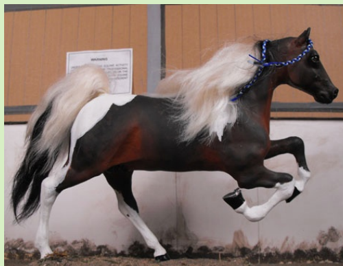
Hit The Switch 25 Years Old!

CM by Sue Guffey in 1992 Owned by Sue Sudekum