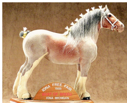
RES. CHAMPION FLOCKED/OTHER CUSTOM: LADY OF TRIESTE (CM)

1980s WORKMANSHIP DIVISION OVERALL CHAMPION: MON NAFA RANI (CR)