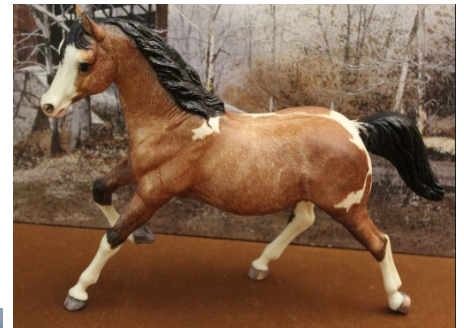
CHAMPION CUSTOM W/FACTORY PAINT: MERRYGOLD (HC)

Retouch/Partial Paint Removal/Etch on Factory Paint (1): 1-Merrygold (HC)