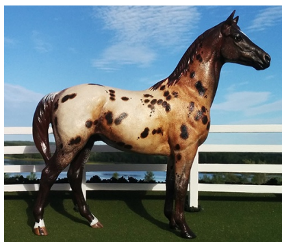
RESERVE CHAMPION REPAINT: PARADOX (SW)

Repaint with Hair Mane/Tail: Traditional Size or Larger (40): 1-Mon Nafa Rani (CR), 2-TS Elegant Gypsy (MP), 3-TS Vesuvius (MP), 4-Encantador (CM), 5-Scimitar (SS), 6-Fiesta Jones (LB), 7-DQ Star-sparkle (AP), 8-LJ American Beauty (SM), 9-Classy Chassis (SS), 10-Dun Ridge (JG), HM-Angel Eyes (AP)