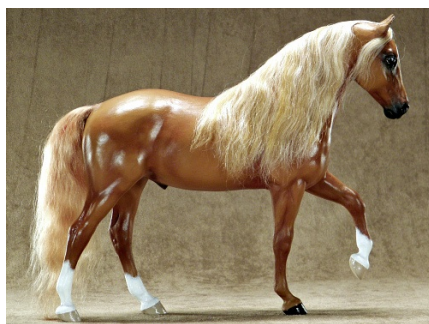
CHAMPION SPANISH BREED: EN-CANTADOR (CM)