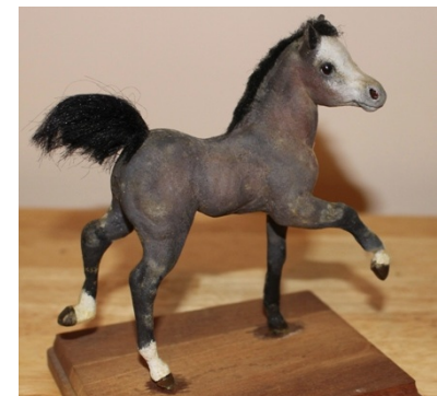
RES. CHAMPION FOAL: KISSAWOOKIE (LB)

1960s/1970s BREED DIVISION OVERALL CHAMPION: BROTHER LOVE (LB)