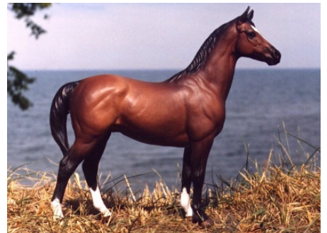
CHAMPION SPORT BREED: NORTHERN DANCER (TM)

Other Pure or Mixed Sport Breed (1): 1-Wing'd Jaguar (SS)