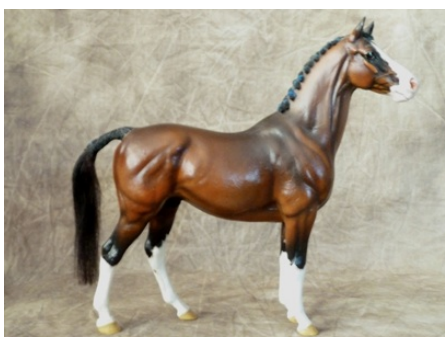
RESERVE CHAMPION SPORT BREED: CHARLES LE MAUVAIS (PO)

Paso Fino/Peruvian Paso (6): 1-Encantador (SM), 2-Trueno Azul (CM), 3-Mago CDM (KM), 4-Diamond Majestad (CM), 5-Stephano (JW), 6-Cancion De Amor (AP)