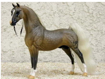
CHAMPION PONY/MINIATURE HORSE: 21ST CENTURY BOY (KM)

Other Pure or Mixed Pony Breed: (7) 1-Tug Hill Minstrel (CM), 2-Tug Hill Pied Piper (CM), 3-LBR Tjorben (JG), 4-KT Draublakken (JG), 5-Mystique (SL), 6-Southern Cross (CM), 7-Althea (STR)