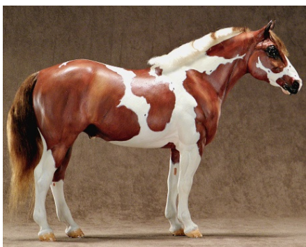
CHAMPION SIMPLE REMAKE/REPAINT/HAIR OR SCULPTED MANE/TAIL: APACHE RED CHIEF (CM)

Simple Remake & Repaint with Non-Hair Mane/Tail: Smaller than Classic Size (1): 1-DW Interpretation (HC)