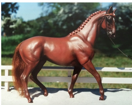
RES. CHAMPION REPAINT/HAIR OR SCULPTED MANE/TAIL: HALF A SHADOW (SN)

Simple Remake & Repaint with Hair Mane/Tail: Traditional Size or Larger (59): 1-Amantus VS (SN), 2-TS Grassland Sunrise (MP), 3-Southern Comfort (JG), 4-