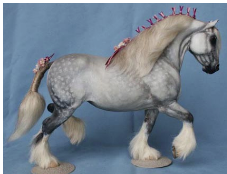
CHAMPION DRAFT BREED: RM NU-CLEAR WINTER (KW)

Other Pure or Mixed Draft Breed (9): 1-W.E. Tonka (HC), 2-TS Dragon Knight (MP), 3-Blue Light Special (SS), 4-DO Bessancour Moulin Rouge (JV), 5-TS Druid Allanon (MP), 6-Pippilotta-Elmar (JV), 7-Wish He Wood (KM), 8-Wishful Thinking (KM), 9-Captain Leesa (HC)