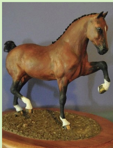
Birchwood Geisha Boy 40 Years Old!