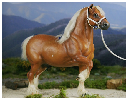
CHAMPION DRAFT BREED: RM MAXIMUS (CR)

Other Pure or Mixed Draft Breed (3): 1-Tuff Enuff (CC), 2-*So Viktor Alexi (SR), 3-Simmerl (SN)