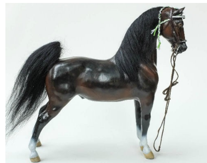
RES. CHAMPION GAITED BREED: SIR ARTHUR (HC)

Clydesdale/Shire (7): 1-Sparrowwood Beauty (SS), 2-Dominion Blue Douglas (SS), 3-Lady of Trieste (CM), 4-Belle (HC), 5-Royal Witch (AP), 6-Castlekeep Mistress (LB), 7-Diamond Blue Rose (CR)