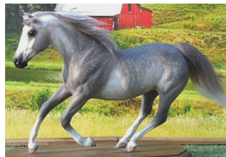
CHAMPION EXTREME REMAKE/RE-PAINT/HAIR OR SCULPTED M/T: DIA-MOND HANDSOME DEVIL (BH)

Extreme Remake & Repaint with Non-Hair Mane/Tail: Trad. Size or Larger and Classic and Smaller than Classic: none