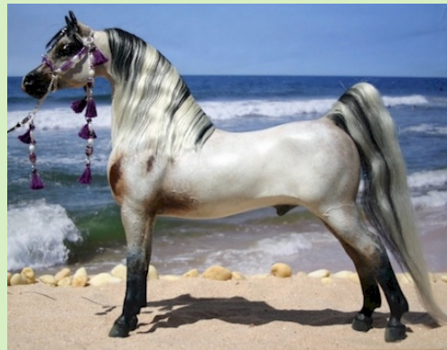
TS Desert Paradise 20 Years Old!

(Have one created in 1963, 1968, 1973, 1978, 1983, 1988, 1993, or 1998? Get it into the Birthday Barn spotlight by e-mailing its photo and info to our Gmail address below!)