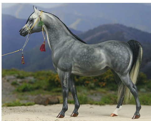
MON NAFA RANI