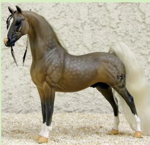
21st Century Boy 30 Years Old!