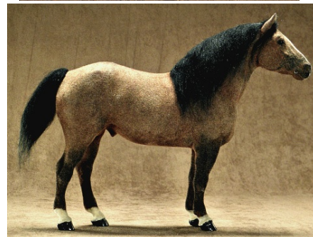
RES. CHAMPION DRAFT BREED: TUG HILL BY REQUEST (CM)

American Pony (3): 1-BR Danton (HC), 2-Diamond Playtime (CM), 3-Lady Red Diamond (AP)