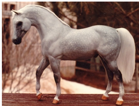
CHAMPION SIMPLE REMAKE/RE-PAINT/HAIR OR SCULPTED MANE/ TAIL: ALMAZ CZAR (KB)

Simple Remake & Repaint with Hair Mane/Tail: Smaller than Classic Size and Simple Remake & Repaint with Non-Hair Mane/Tail: Traditional Size or Larger and Simple Remake & Repaint with Non-Hair Mane/Tail: Classic Size and Simple Remake & Repaint with Non-Hair Mane/Tail: Smaller than Classic Size: none