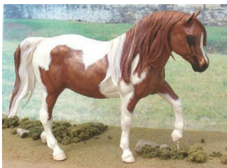
RESERVE CHAMPION PONY/MINI HORSE: REESE'S PIECES (HC)

Longear (5): 1-So Molson Canadien (SS), 2-Gallimaufry (SS), 3-Gentleman John (BH), 4-Bob (SS), 5-Pam-mule-a (KW)