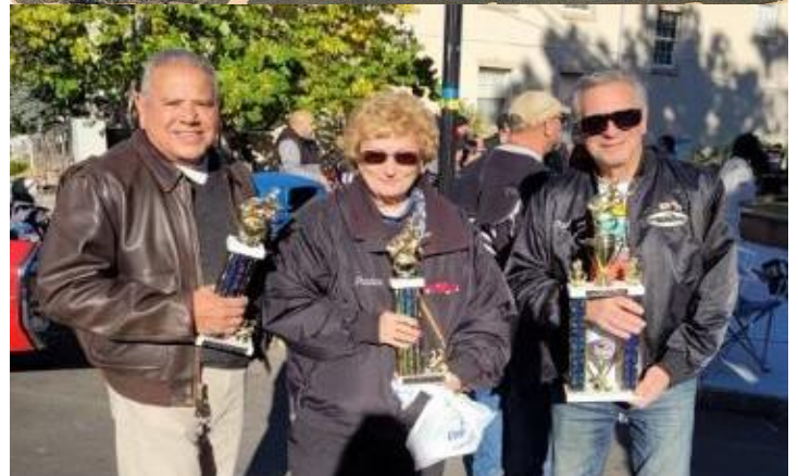
One of the last shows - Perth Amboy