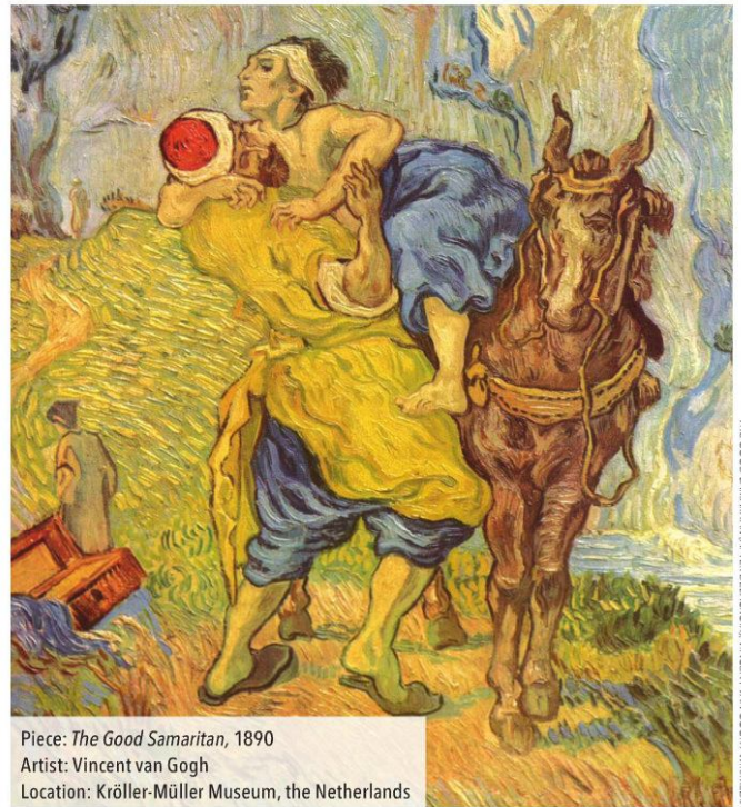
Piece: The Good Samaritan , 1890 Artist: Vincent van Gogh Location: Kröller-Müller Museum, the Netherlands