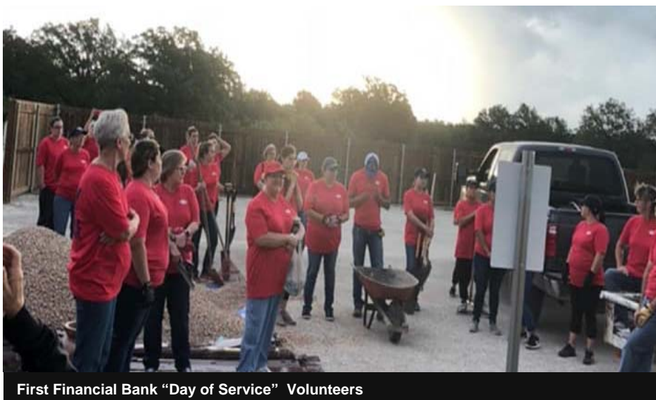
First Financial Bank “Day of Service” Volunteers

Local investment, donations, and other monetary gifts account for approximately two-thirds of the financial assistance provided to ECCC clients.