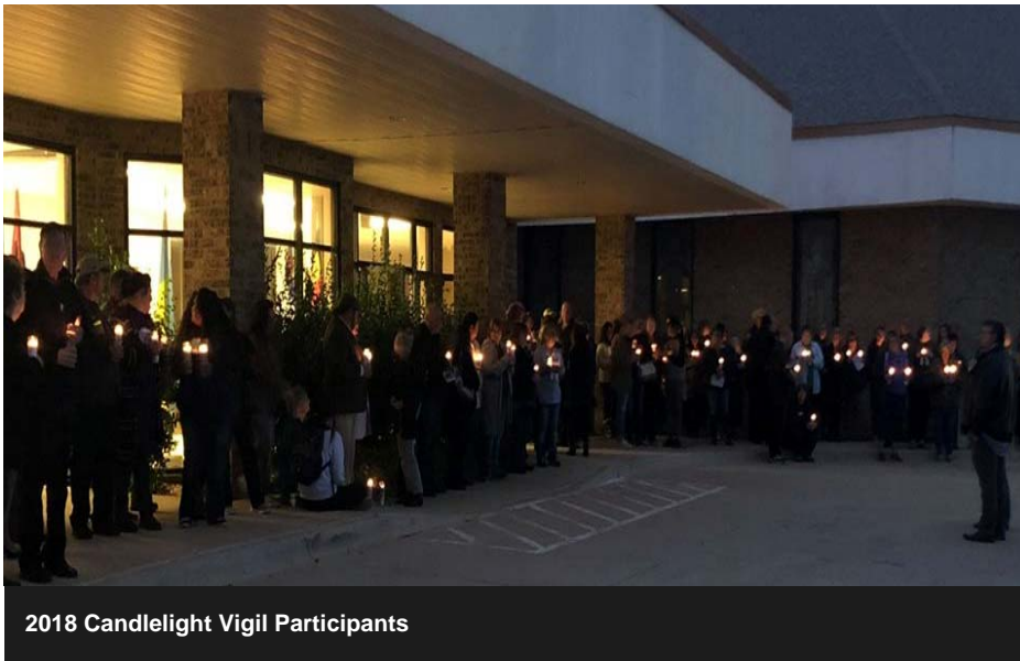
2018 Candlelight Vigil Participants