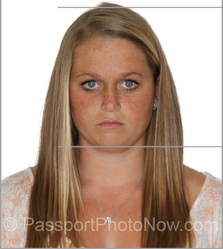
Canadian Citizenship Photo