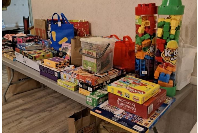
The toys were donated to the Haverstraw NY youth center