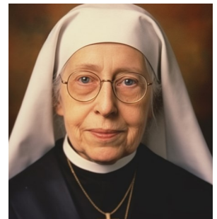
Feast Day: March 3