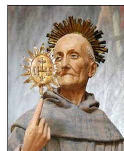
Feast Day: May 20