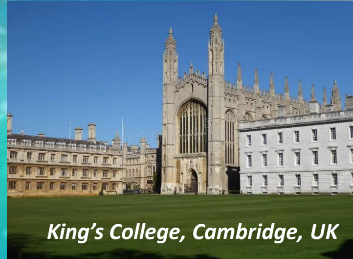
King's College, Cambridge, UK