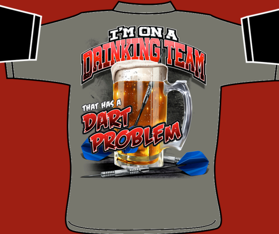
BR1021 DART PROBLEM