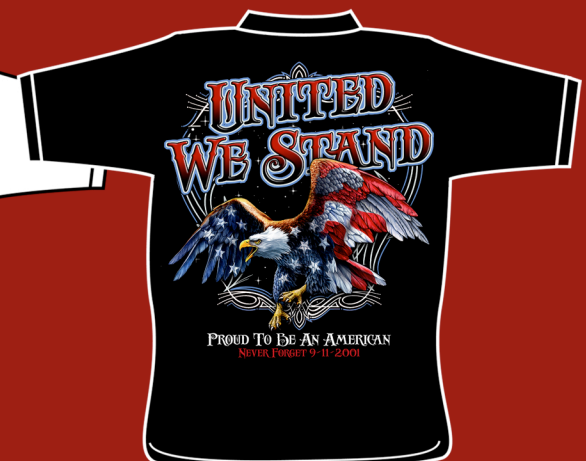
BR1032 UNITED WE STAND