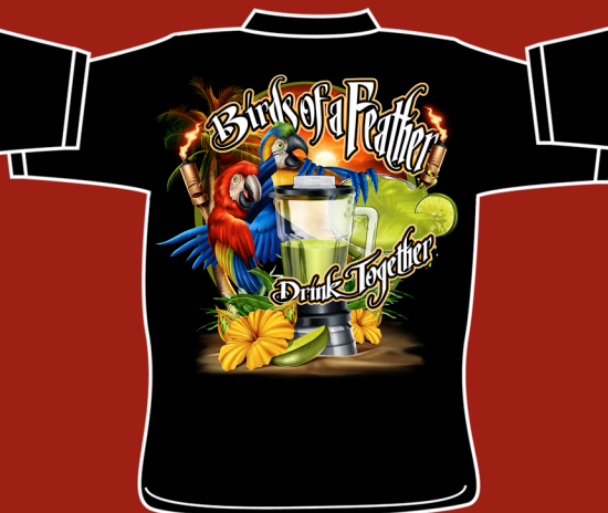
BR1024 BIRDS OF A FEATHER