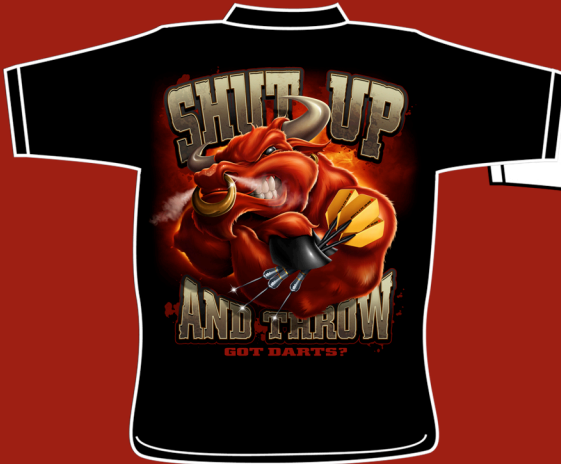
BR1010 SHUT UP & THROW Available on black only.