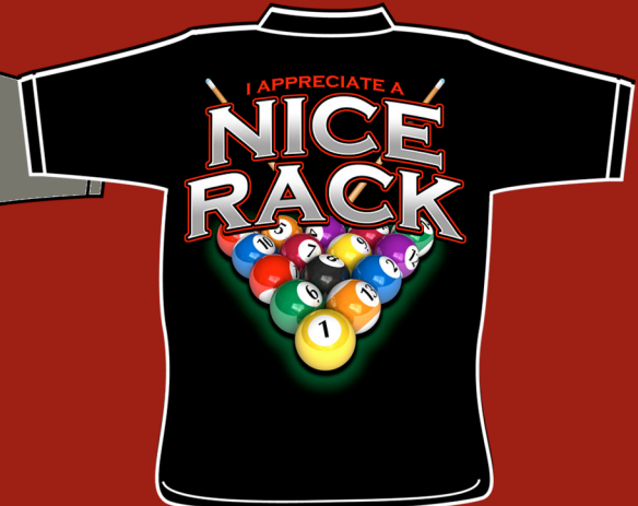
BR1017 NICE RACK Available on black only.

Designs and styles are subject to change without notice. Please consult our website at www.BarRags.com for the most current collection of designs.