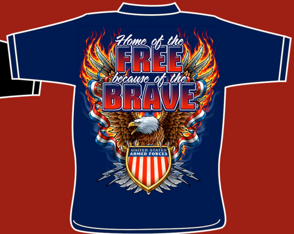
BR1009 HOME OF THE FREE Available on navy blue only.