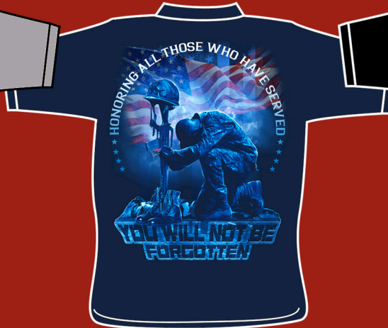
BR1034 HONORING SOLDIER Available on navy blue only.