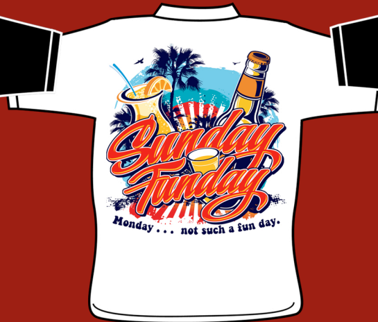
BR1012 SUNDAY FUNDAY Available on white only.