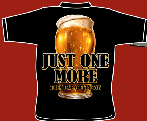
BR1014 JUST ONE MORE Available on black only.