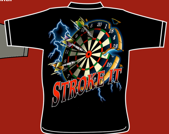
BR1022 STROKE IT