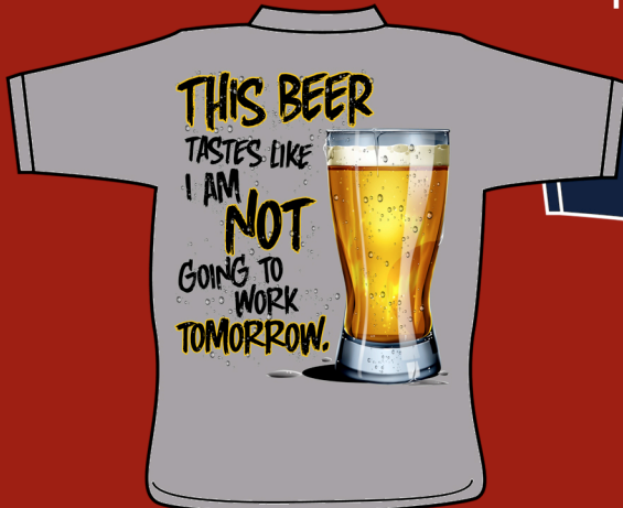
BR1033 NO WORK TOMORROW Available on gravel grey only.

All designs on this page are screen printed on the back. The front of the shirt will be printed with your bar's information.