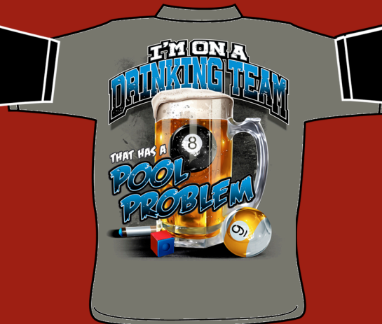
BR1015 POOL PROBLEM Available on charcoal grey only.