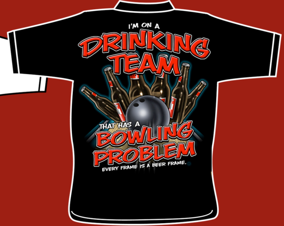
BR1013 BOWLING PROBLEM Available on black only.