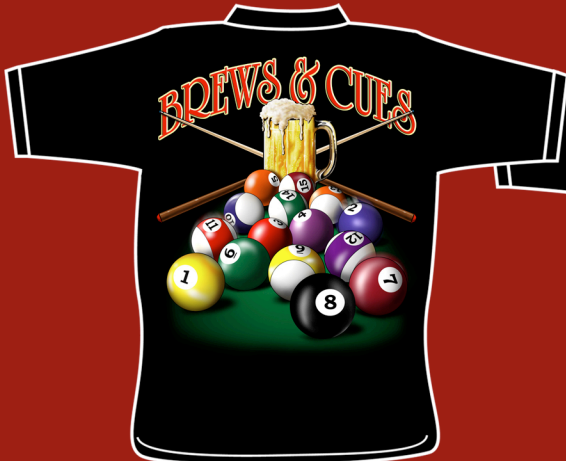
BR1023 BREWS & CUES