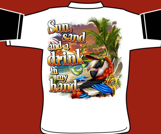
BR1028 DRINK IN MY HAND