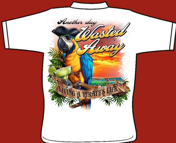
BR1036 WASTED AWAY Available on white only.