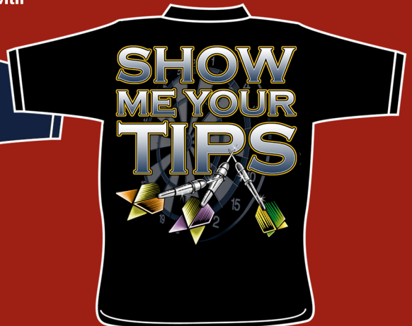
BR1035 SHOW ME YOUR TIPS Available on black only.