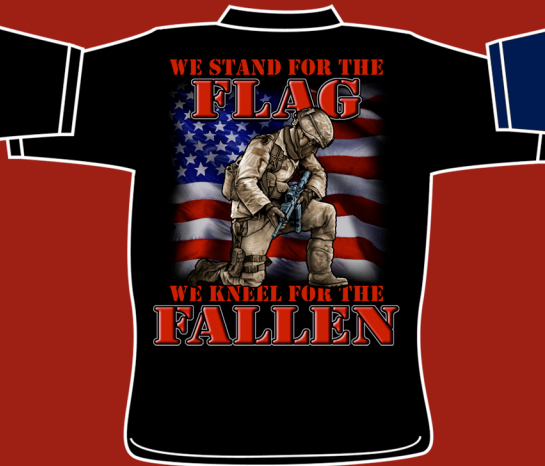
BR1005 WE STAND WE KNEEL Available on black only.