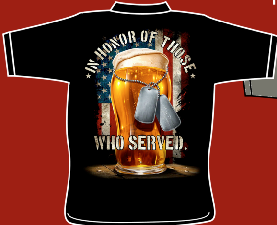
BR1019 DOG TAGS

All designs on this page are screen printed on the back. The front of the shirt will be printed with your bar's information.