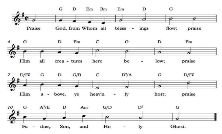
Doxology, written in England for Protestant Churches in 1674.

As the offering is brought forward, we will sing the Doxology.