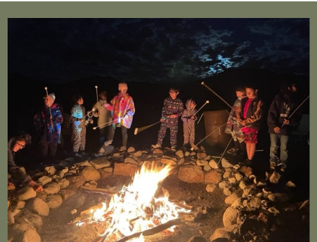
Tribal Led Activities