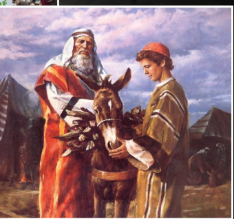
IF Abraham was indeed born in -1948 BC then some simple MATH can be asserted to come up with a unique date from this reference point.

The work of the atonement of the Son by the Father comes with a land covenant, that of the 'Palestinian' one. It comes the Greater Israel that is yet to be realized. It will only occur during the 1000year Kingdom of the Messiah when Jesus r<u>eturns. The physical geo</u> political boundaries of the borders of Greater Israel will be given to the descendants of Abraham by way of Isaac, not Ishmael. The spiritual 'land' or inheritance, that to include the whole Earth will be given to the Gentiles through Jesus Christ.