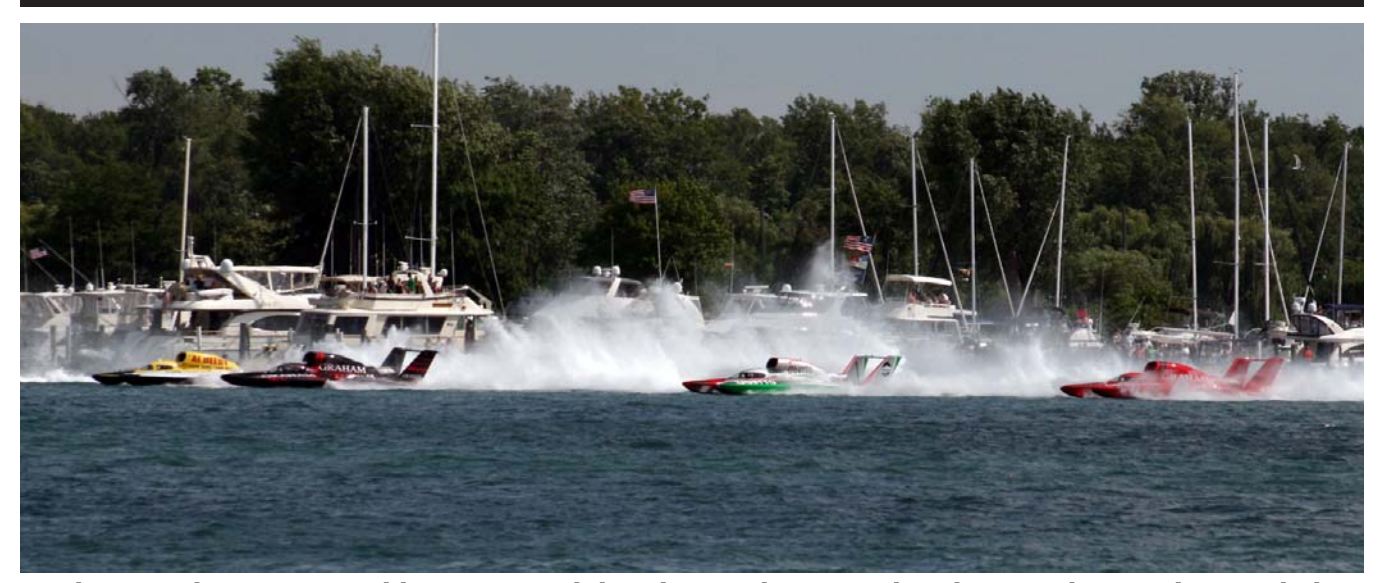
mark too early. It was quickly announced that they each received a 1 lap penalty. Graham ended up in lane 1; Oberto was in lane 2, Graham II in lane 3, CFS in lane 4, and Webster Racing in lane 5.