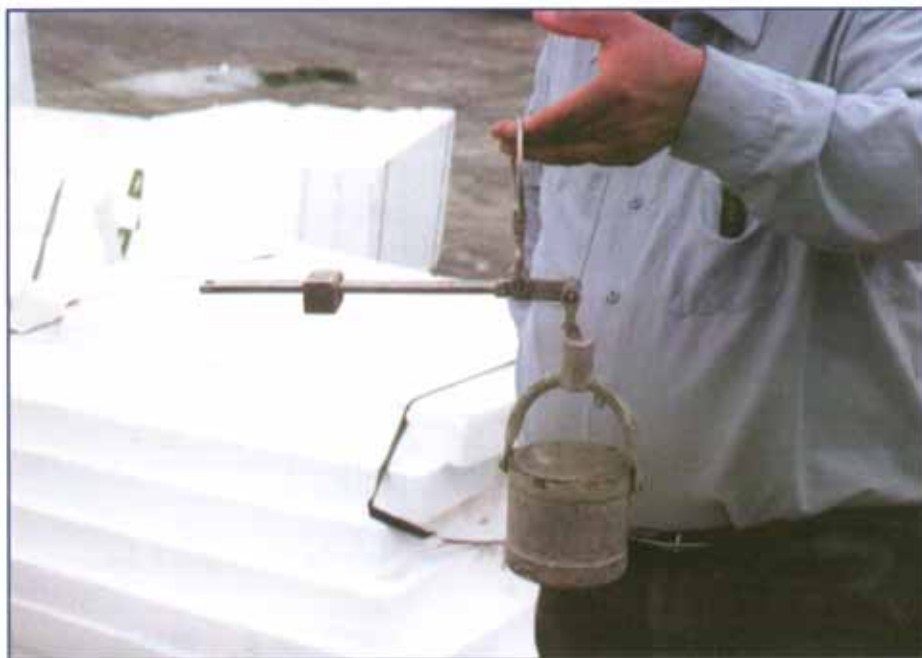
Photo 2: A steel vessel of known volume attached to a balance scale may be used to determine weight.