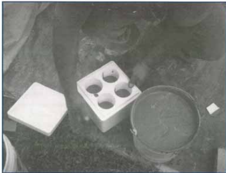
Photo 8. Test specimens are molded in EPS cartons.

mately 1/4 inch. The reading is divided by three to obtain the relative compressive strength of the lightweight insulating concrete. However, the test does not provide sufficient repeatable data or the precision to use as a single source of evaluation for lightweight insulating concrete. Using this test method together with the base sheet fastener pull-out test and visual observations can provide useful information to assist project personnel in determining the "readiness" of the lightweight concrete fill.