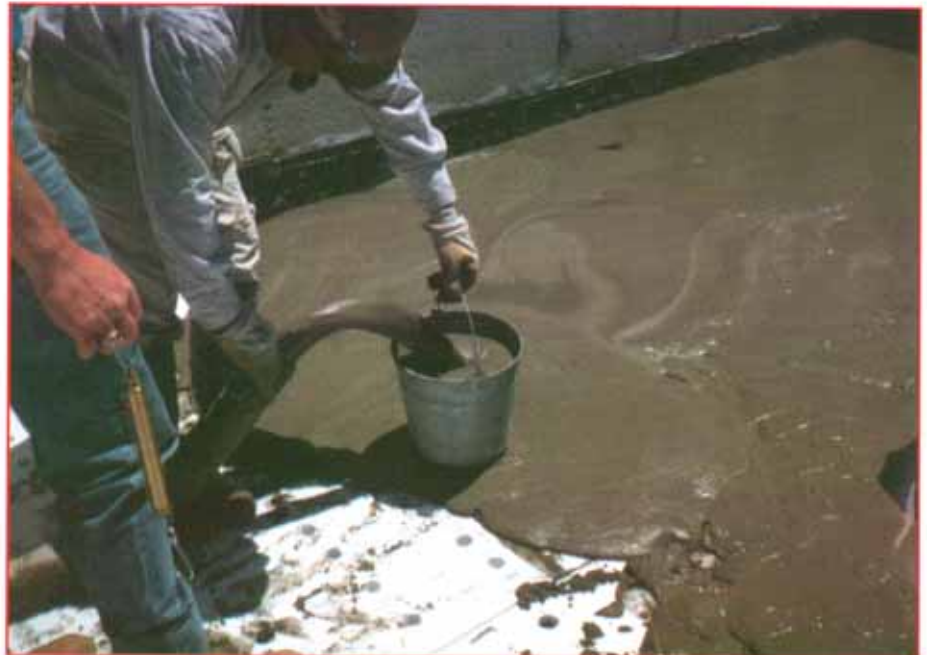
Photo 1: A 10-quart steel pail is commonly used for the "pail test."

Lightweight insulating concrete fill, like many other components of the roofing assembly, is "manufactured" and installed in the field. Maintaining proper procedures during the batching and installation processes is essential to achieving the desired performance characteristics of the lightweight insulating concrete. Several testing procedures can be implemented during and/or after the placement in order to evaluate the properties of the lightweight insulating concrete. Wet density, fastener pull-out resistance, compressive strength, and dry density are some of the common physical characteristics determined by testing. These test procedures not only evaluate the quality of the lightweight concrete fill but also determine the adequacy of the lightweight concrete for receiving the new roof assembly.