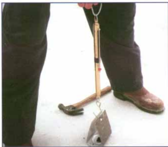
Photos 3 and 4: A spring-type (fish) scale (left) and a custom-fabricated sheet metal holding clamp (right) may be used for pull-out resistance tests on base sheet fasteners.

Determination of wet density is performed during the placement of the lightweight insulating concrete. The wet density should be determined at various times during the day as the lightweight insulating concrete is being batched and placed. The wet density should be measured at both the hopper and the point of placement. Wet density can be determined simply by placing the batched mixture in a steel container of known volume and weighing the filled container. By knowing the weight and volume of the filled container, one can calculate the wet density of the mix. A steel pail with a volume of 10 quarts is commonly used by deck applicators for performing this procedure (see Photograph 1 ). The 10-quart container equals 2-1/2 gal-