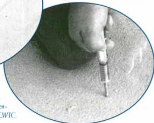
Photo 7: A hand-held penetrometer is used to verify the density of the "cured" LWIC.