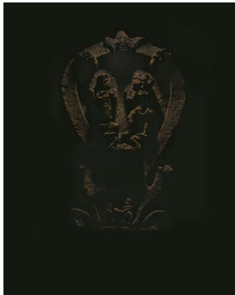
LEFT: LINGAM, 2013, C Print mounted on aluminum, framed without glass, 70 x 60 in. 177.8 x 152.4 cm. RIGHT: YONI, 2013, C Print mounted on aluminum, framed without glass, 70 x 60 in. 177.8 x 152.4 cm.

BETWIXT AND BETWEEN , a solo exhibition by photographer Hugo Tillman, will be on view at Nohra Haime Gallery from February 19 th to March 29 th .