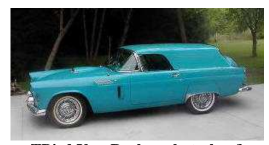
TBird Van-Real or photoshop?