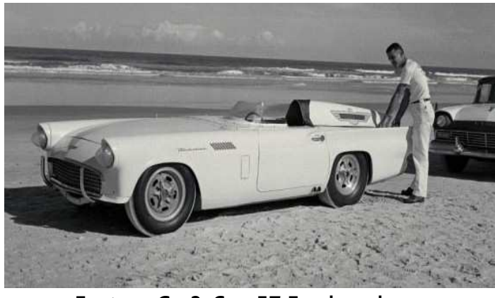
Factory Car? See 57 Ford push car