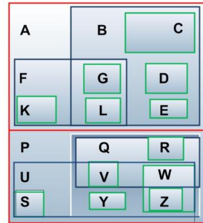
Fig.2: range Grouping in R- Tree

team information products according to their range from each various other, and also designate minimum and optimum bounds to them. Each document at the fallen leaf node, describes a solitary product.