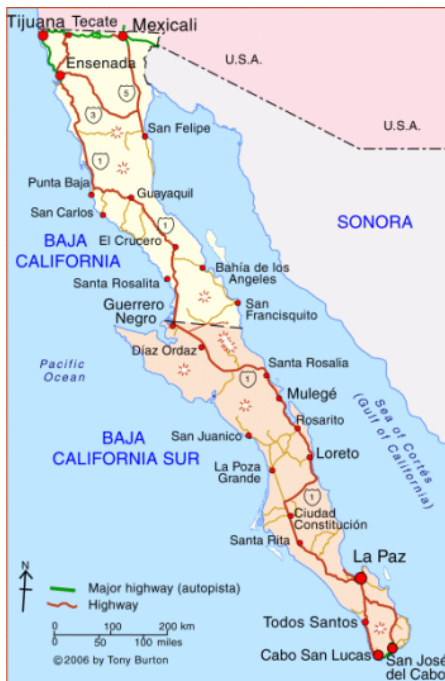
Map Showing Cabo San Lucas, La Paz, Ensenada & The Province of Sonora

The happenstance that brings William Walker into the filibustering arena in 1852 is a visit with travelers just back from the port city of Guaymas, in the Mexican province of Sonora. The picture they paint is of territory ripe for silver prospectors, beset by tribal raids, and largely absent any basic civic authority.