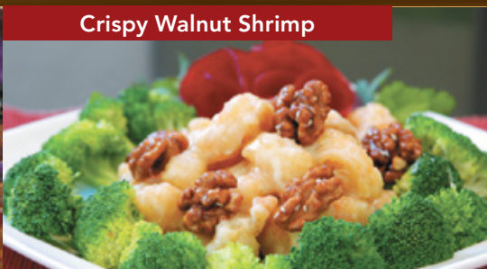
Crispy Walnut Shrimp