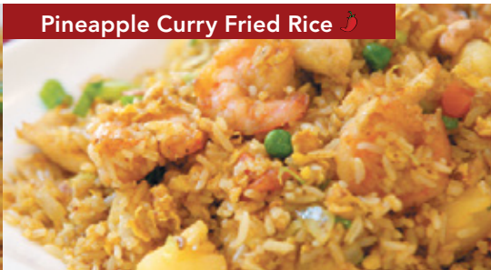
Pineapple Curry Fried Rice 🌶️