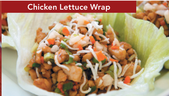
Chicken Lettuce Wrap