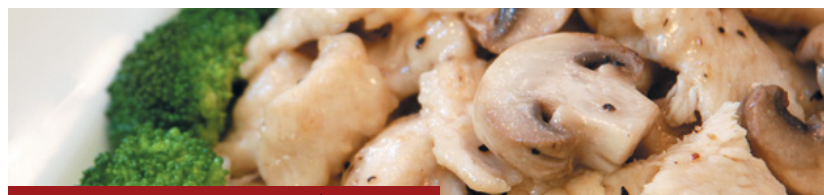
Heaven Chicken 🌶️

Chicken breast, organic wild mushrooms, snow peas and carrots stir-fried in brown sauce 19.49