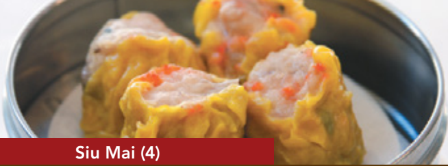
Siu Mai (4)