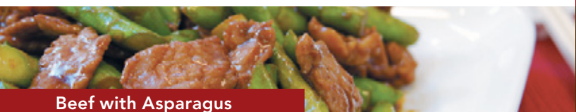
Beef with Asparagus

From 11:00am-3:00pm all of the items below are served with hot and sour soup or chicken corn soup and salad.