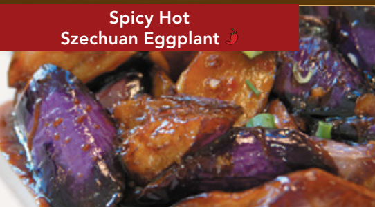
Spicy Hot Szechuan Eggplant 🌶️