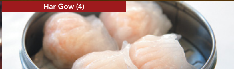
Har Gow (4)