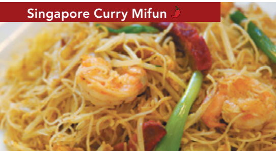
Singapore Curry Mifun 🌶️