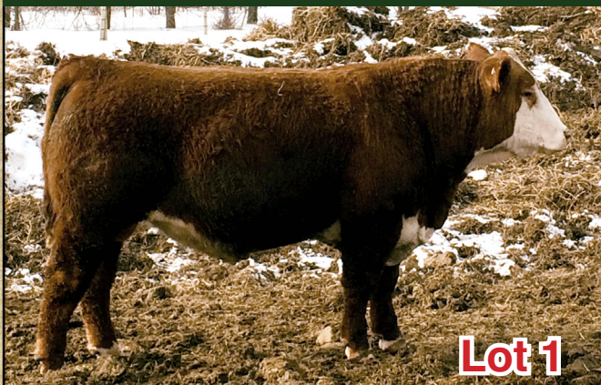
GANT TARGET 372

Sire: R On Target 5523 MGS: JDH 15T Wrangler 25W BW 3.2 WW 54 YW 87 MM 23