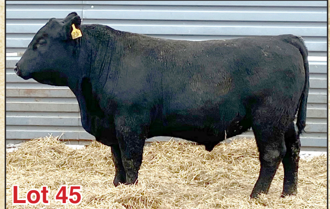
GANT UPGRADE 457

Sire: WAR Upgrade Y155 U161 MGS: WAR Forefront BW 2.4 WW 54 YW 110 M 22