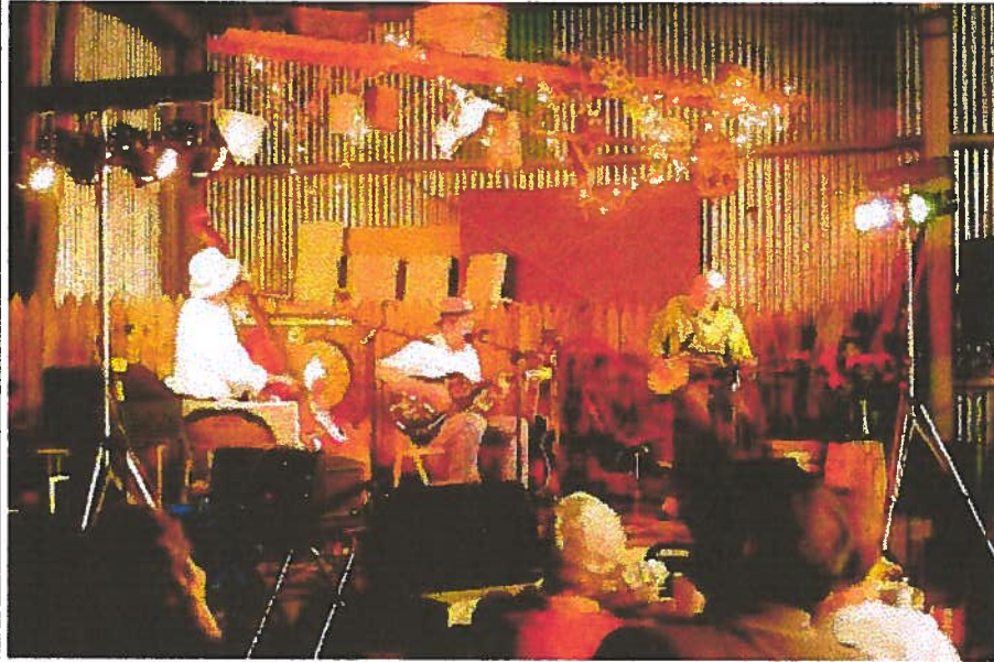
5(Photo at Top) Pete Seeger, right, joins Duane Brown and Rudy Littrell, the E-flat Porch Band, following a beans and cornbread dinner Friday night at the Stokes Ranch.