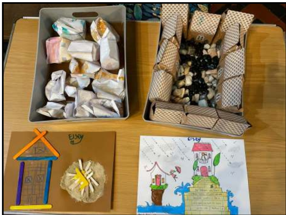
Photo from February Messy Church. Report on page 9