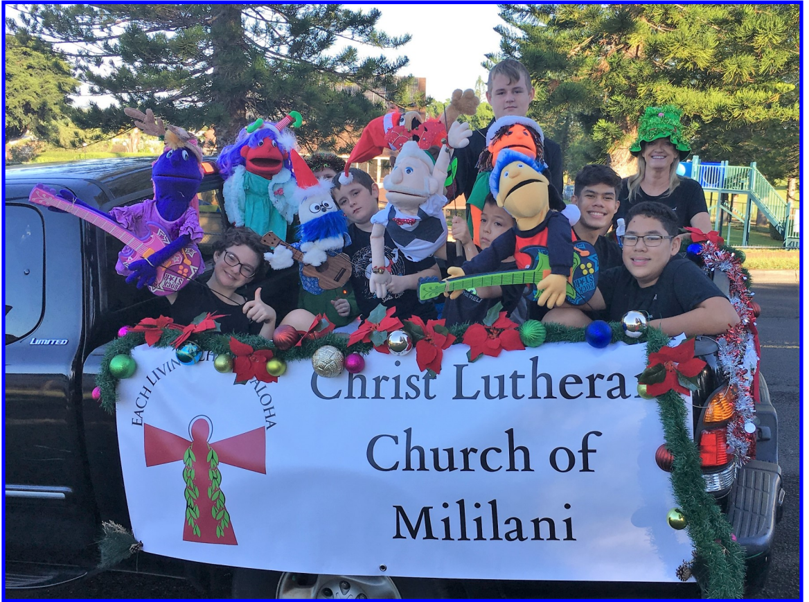
Mililani Christmas Parade