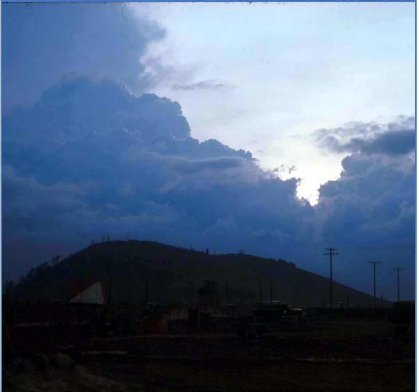
Storm clouds behind Dragon Mountain.