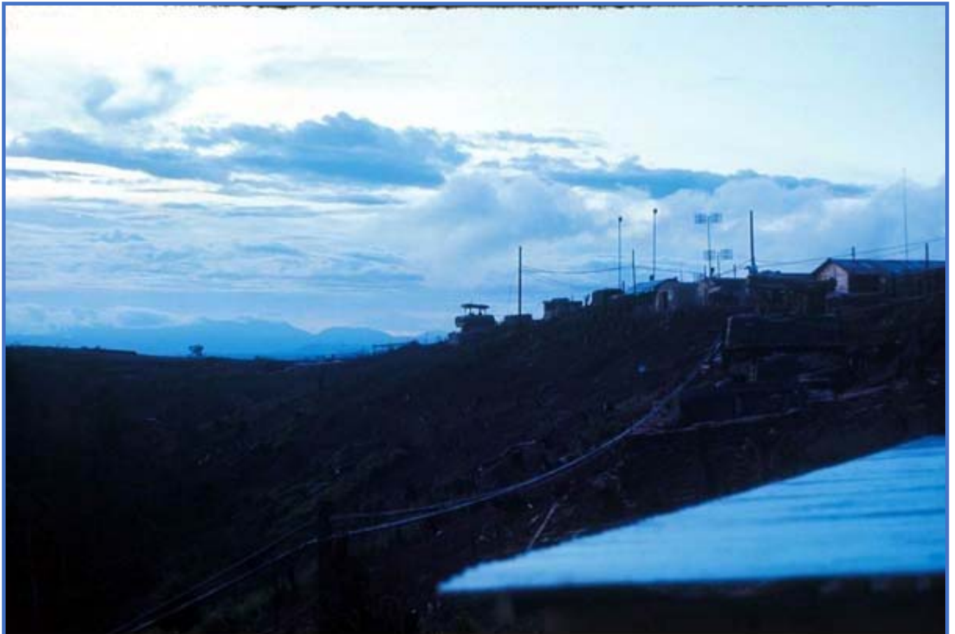
Det 3, Pleiku at dusk.