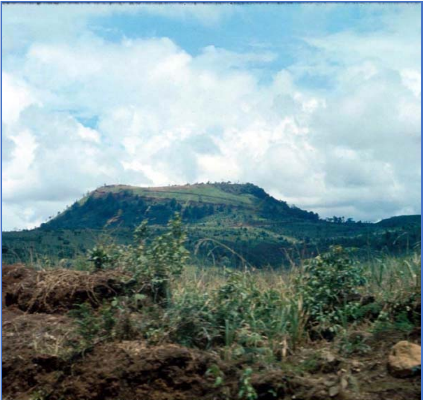
Dragon Mountain up fairly close.