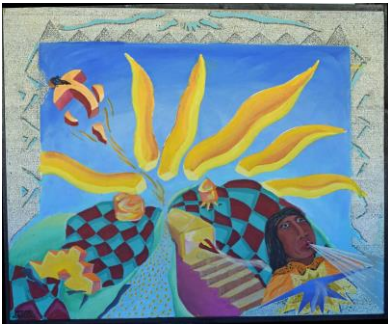
The Winds of City Terrace

1991, 48" x 60", acrylic on canvas $2,000.00