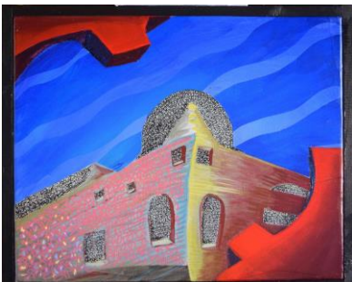
Stories On 3802 Brooklyn Avenue 2024, 16" x 20", acrylic on canvas, framed. $600.00