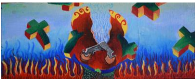
Blown Away Horizontally

2024, 56" x 64", mixed media on canvas roll $1,000.00