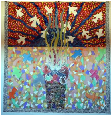
Blown Away On 3802 Brooklyn Ave

1990, 36" x 48", acrylic on canvas, framed NFS