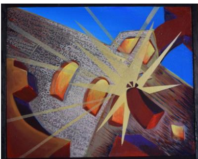
In and Out 2024, 16" x 20", acrylic on canvas, framed $600.00