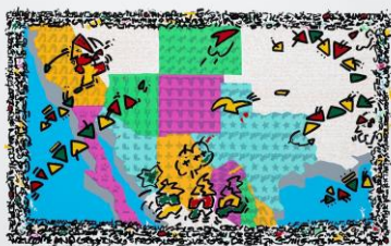
Welcome to Aztlan 1987, 26" x 40", silkscreen, framed $1,000.00