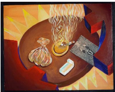
Figs, Smokes, and Arturo's Work 2024, 16" x 20", acrylic on canvas, framed. $600.00