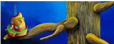
The House on Stringer