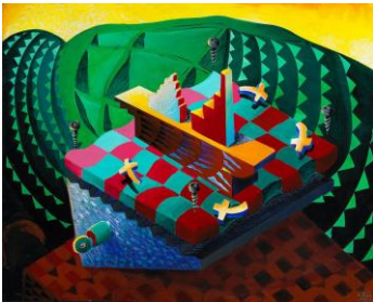
Teotihuacan: Bolting Down the Culture

Fifty percent of all sales will go to the continuation of CASA0101 programing.