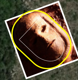
Ancient Ruins FACE OF ALA-LU

The purpose of this study is to present the evidence that the geometric ley-lines of the following temple layout is set to the Cydonia, Mars ley-lines. Pertaining to the Cydonia, Mars anomalies, there are 3 main pyramid structures that comprise the Martian Motif . There is the famous Face of Mars , the giant Pentagon Fortress and the Pleiadian Pyramid City . These 3 structures triangulate each other and would make up the core of a large metropolitan city on Earth. What is astonishing is that such a Martian Motif is seen implemented in the architecture of almost all the ancient civilizations on Earth. This started, at least based on the archeological record after the Flood of Noah with Babylon and Sumer. How the Martian Motif is tied to the ley-lines of ancient cities, temples and structures is that perhaps the lost knowledge and connection of the Martian civilization was conveyed to the few and selected 'priestly' class on Earth that constitutes the Secret Societies, etc. This special class of humans are perhaps tasked at keeping the legacy, lifeline and bloodline operational. Even now in the modern era, the same Cydonia, Mars motif is incorporated into the major capitals.