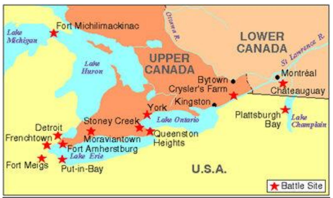
The War of 1812 Begins Along the Canadian Border

As in 1775 war with Britain, America assumes that a quick strike into Canada will succeed, and perhaps even cause the British to back away from further fighting. As Jefferson says: