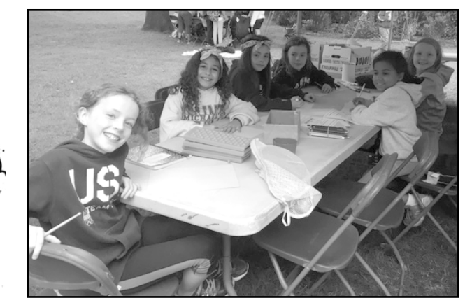
(above) Girl Scouts at their Annual Encampment making signs for the HPC duck race in 2018.