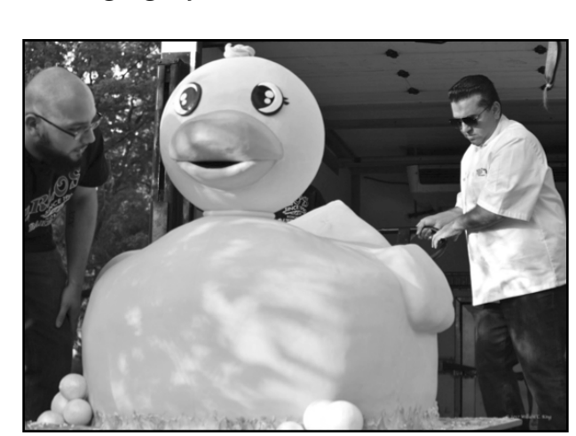
(above) Cake Boss legend, Buddy Valastro gifted an incredible cake for the 2017 Rubber Ducky Race.