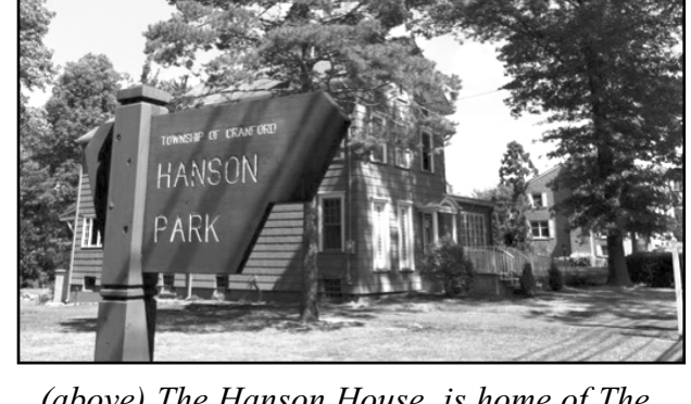
(above) The Hanson House is home of The Cranford Historical Society and HPC offices.

Hanson Park is located at 38 Springfield Avenue in Cranford, a hidden gem behind The Hanson House. The park features a variety of botanical settings as well as paths and reflection areas, featuring: Butterfly Meadow, Rain Garden, Herb Garden, and Woodland Stone Amphitheater. The Conservancy also maintains the planting and landscaping.