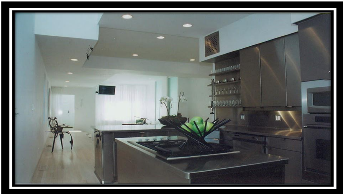
Below: Residential application of Architectural Series.