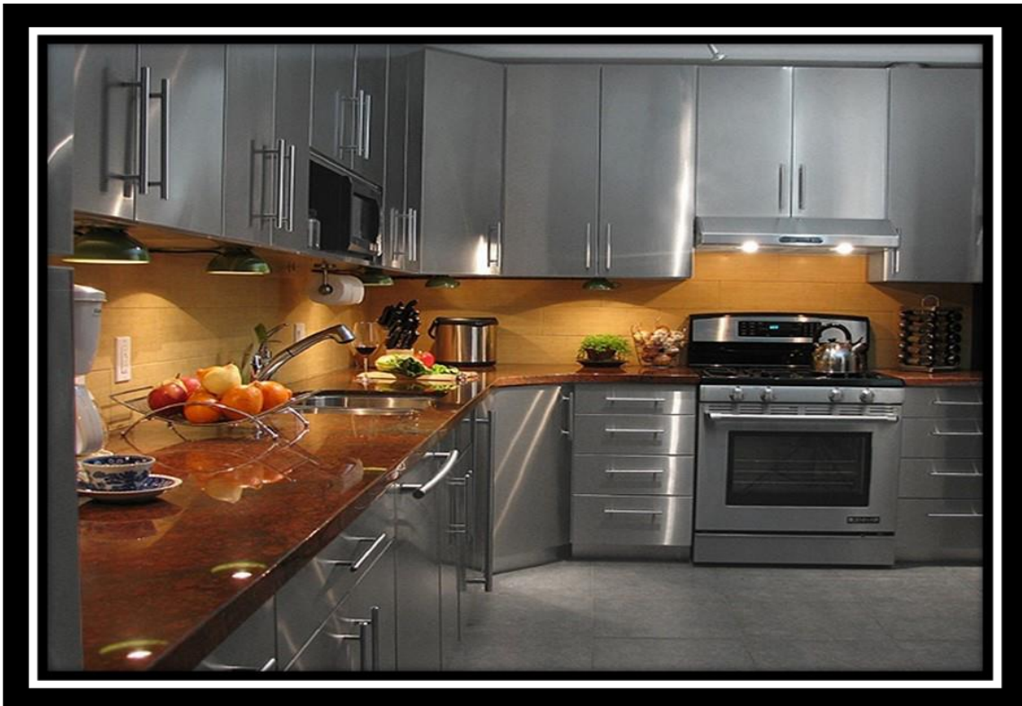
Below: Designer Series cabinets look the same on the outside as our Architectural Series cabinets.