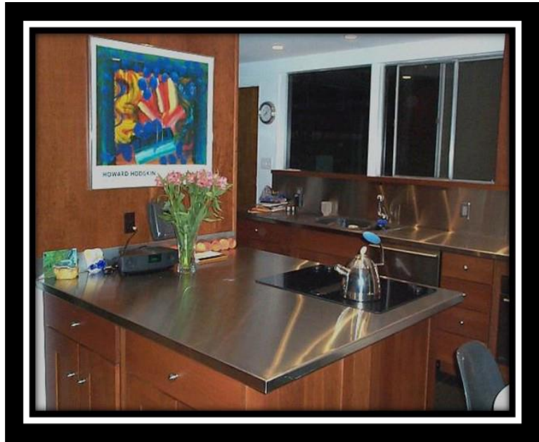
Above: Stainless steel island countertop. They are not only high quality;

We are committed to providing an entire range of stainless steel products and offer integral sinks in our countertops. The stainless steel sinks we use are constructed of heavy 18 gauge stainless steel, #4 finish. Single and double bowls, standard and rectangular (zero radius) configurations are available. To create a seamless finish, these sinks are integrated (welded-in) into a stainless steel countertop using precision micro-welding and micro-polishing techniques.