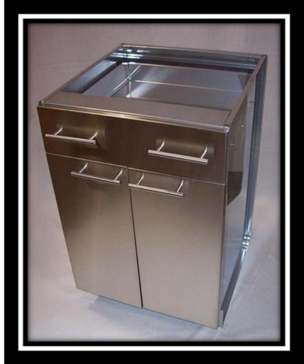
Above: Standard one drawer/two door Architectural Series cabinet. See our catalog of cabinets for all sizes and configurations.

For the ultimate in quality and corrosion resistance, our Architectural Series cabinetry is suitable for both outdoor kitchens and commercial kitchens with the option of 6" legs to meet NSF-2 standards. Constructed entirely of stainless steel, our Architectural Series cabinets are suitable for both interior and exterior use, as well as food industry applications. Cabinets are constructed entirely of types 304 and 430 stainless with a #4 brushed finish. Cabinets are shipped with a protective PVC plastic film to protect them until they are installed. We provide quality craftsmanship and aesthetic design. Using 18 gauge stainless steel, our cabinets provide extra durability and resistance as compared to 20 gauge used by most industry competitors (18 gauge is 30% heavier than 20 gauge). The cabinet components are securely assembled using stainless steel fasteners and corner stiffeners. The Blumotion rails and stainless drawer boxes provide an excellent soft close feature. We only use Blum hardware for all of our series of cabinetry.