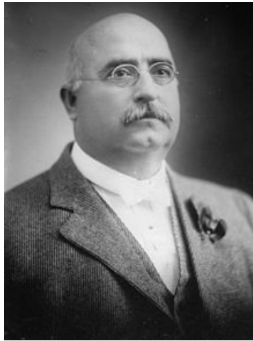
Governor George W. P. Hunt

Editor's note: George Wylie Paul Hunt was Arizona's first state governor and was governor of the state six times with an interesting twist as pointed out on the National Governors Association website www.naga.org , "In 1916 Thomas Campbell was declared the winner and held office [of governor] for nearly one year before the Arizona Supreme Court determined that in fact Hunt had won reelection." He died on December 24, 1934, and is buried in a large pyramid in Phoenix's Papago Park.