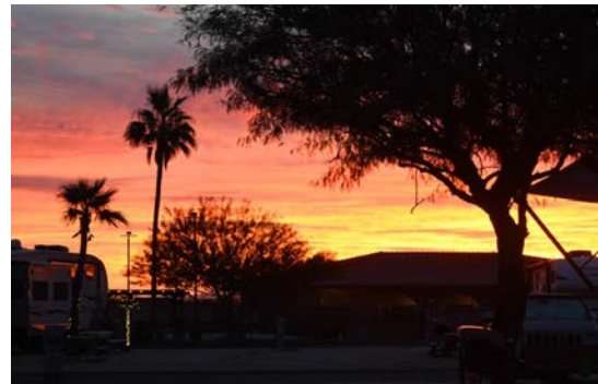
Sunset on 2019