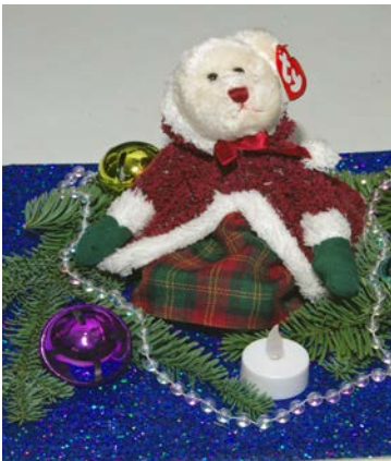
The Hosts provided a different holiday table decoration each day

After dinner the park residents returned to the Barn and held a game night with some of the ANASAZI's participating in the fun.