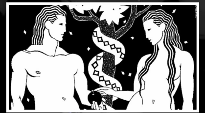
Seeds of the Woman & Serpent GARDEN OF EDEN