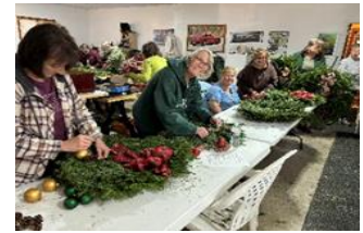
GFWC Menominee Members Decorating Wreaths in 2023

Guiding Harbor is embarking on an exciting new Independent Living Project to complement its current Girlstown residential program for Girls ages 10-18. Once girls reach age 18, they are no longer eligible to be part of the foster care program. To assist with the transition out of foster care, Guiding Harbor is planning to offer a Plus Program which offers housing and teaches life skills for girls from ages 18-22. Additional housing will be required to accomplish this, and a plan is in place to build a facility to accommodate the need. Fundraising has begun and Guiding Harbor is planning a Gala in Novi MI on November 9th. GFWC Menominee is offering support by donating a beautiful spa basket for the Guiding Harbor Gala on November 9. The Basket is filled with essential oils, diffuser, facial products, and other miscellaneous spa related goodies. If you would like to learn more about Guiding Harbor, please visit their website at https://guidingharbor.org/