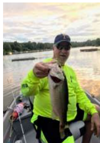
4 th Place