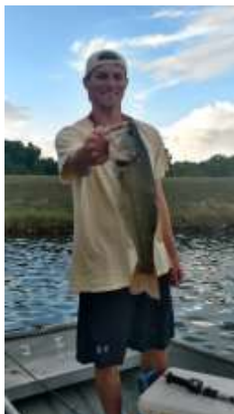
2 nd Place