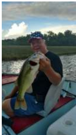
3 rd Place