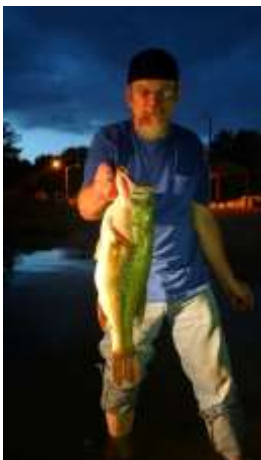
1 st Place

4 th Place went to Jon McKee with a 3lb. 1oz. bass