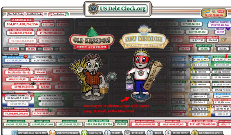
Standing on Revelation 12 Sign with Jupiter being 'Borned', as the Man-Child.

FOR ILLUSTRATION PURPOSES ONLY