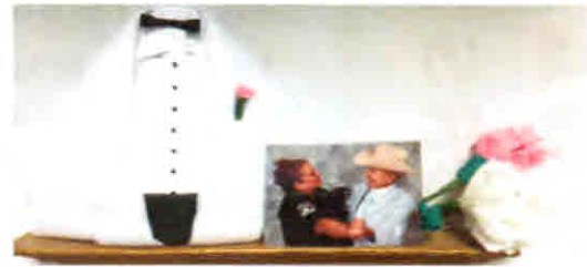
Fond memories of our Young At Heart Senior Prom 2016