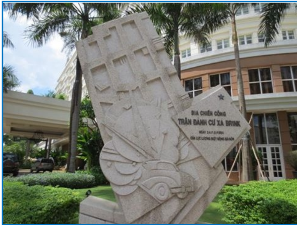
The Memorial to the Brink Hotel bombing as of 2015.