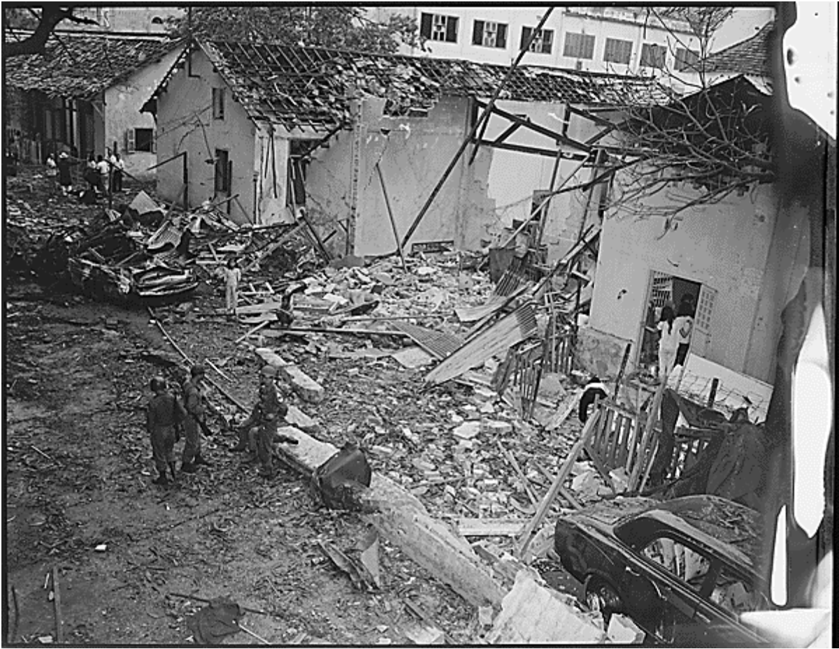
The Brink Hotel following the Vietcong bombing on December 24, 1964. Two American officers were killed.