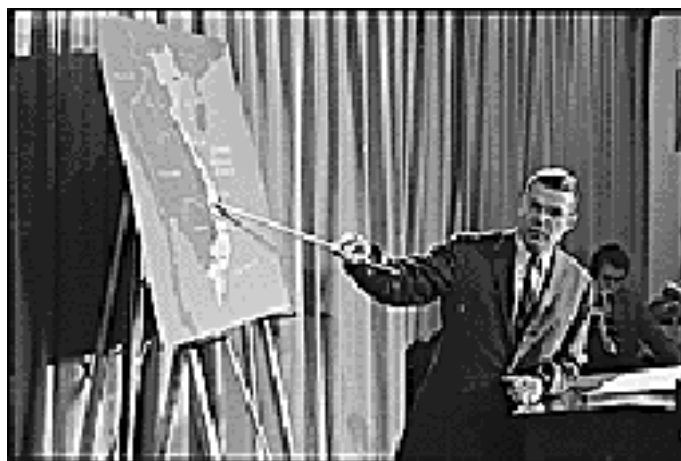
Secretary of Defense Robert S. McNamara's February 1965 press conference at the Pentagon. (Photo taken February 7, 1965.)